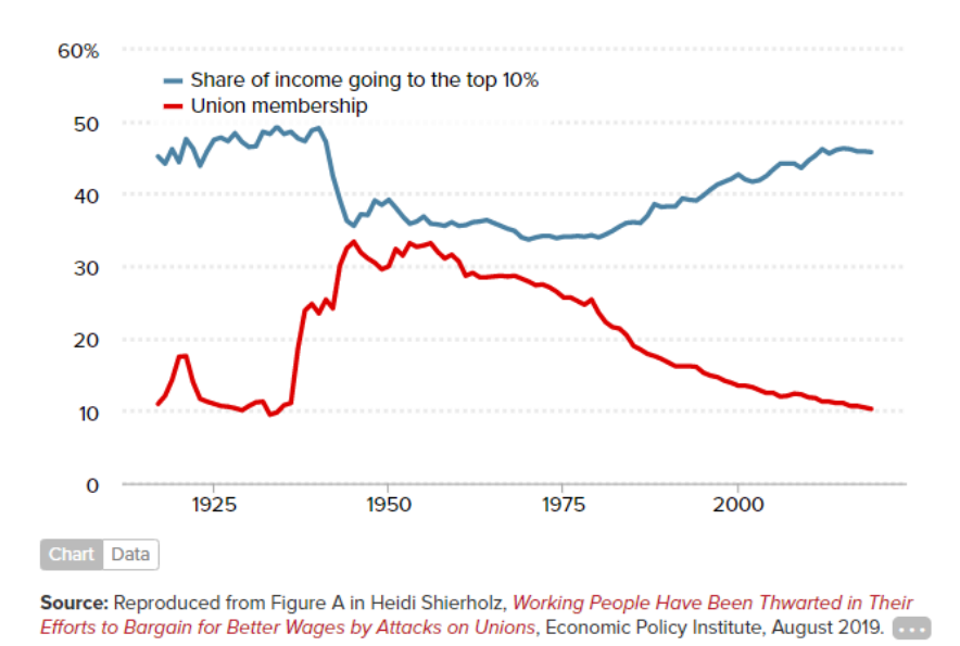
Figure 1: As union membership declines, income inequality increases

health insurance and retirement plans, and protections from discrimination and harassment for all workers. This includes those who have historically been held back, such as women, LGBT workers, Black and Latino workers, workers with disabilities, and older workers. Researchers have found that today's union households earn up to 20% more than non-union households, with an even greater union advantage for workers with less formal education and workers of color. Meanwhile, research has shown that growing economic inequality, growing pay gaps for women and workers of color, and declining voice in our democracy for working class Americans are all caused, in part, by the declining percentage of workers represented by unions.