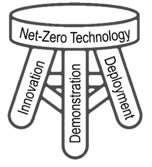
Figure 1: Threefold Strategy for Technologies Needed to Achieve Net-Zero GHG Emissions by 2050

Three recent Federal laws work together to rapidly advance these goals: the CHIPS and Science Act of 2022 expands budget authorities for R&D that can include earlier-stage net-zero innovation; the Bipartisan Infrastructure Law of 2021 enables demonstration of clean hydrogen, carbon removal, and other game-changing climate-aligned infrastructure with appropriations over several years; and the Inflation Reduction Act of 2022 accelerates deployment by pulling clean energy technology to the market through tax credits, loan guarantees, grants, and rebates. While the United States continues to demonstrate and deploy more established technologies, this report focuses on the need to maintain a robust early-stage development pipeline of emerging technologies which will make it substantially easier or cheaper to reach net-zero.